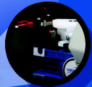
Easy access to limit switch