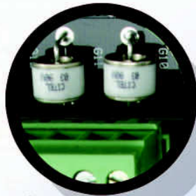
On-board lightning protection

The K-2™ slide gate operator raises the bar in quality for the residential market. This machine operates a highly efficient direct motor drive which allows operation at 100% duty cycle. This assures efficiency and reliability. The fail-safe, fail-secure options of the K-2™ gate operator allows it to handle gates up to 650 lbs. in conformance with UL 325 and UL 991 Type I, III and IV.