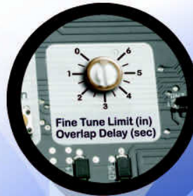
Innovative Fine Tune Adjustment for the end of gate travel (down to 1/8")