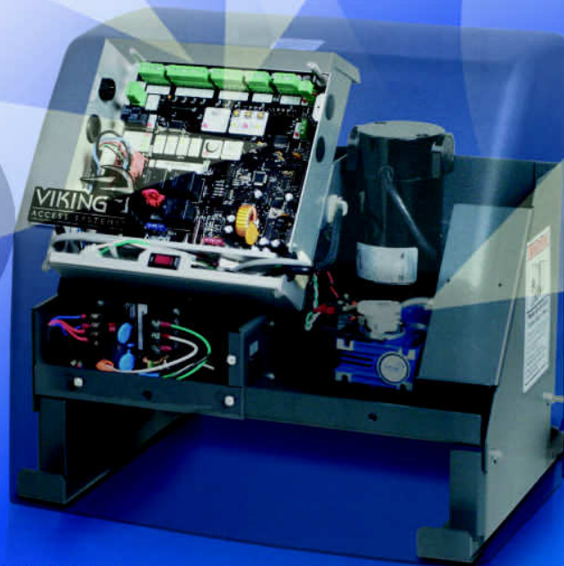
120/220 VAC single phase power source